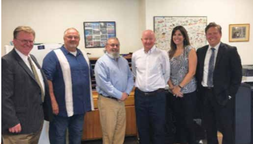
Lake County AIM Team with State Rep Calendar District 61